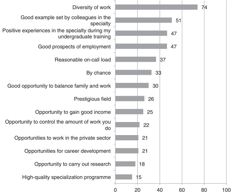
Fig. 1 Motives to choose a medical specialty in Physician 2013 Study. Proportions (%) of working-age medical specialists who answered “Considerably” or “Very much” to the question “If you are a specialist or in specialist training, to what extent did the following items affect your choice of specialty?” in Physician 2013 study (n = 2796)

When looking at the different motives affecting the choice of a medical specialty, the only differences came in Diversity of work , By chance and Prestigious field . The respondents who felt that Diversity of work and Prestigious field were important motives for choosing a specialty had a lower odds ratio to answer “No” to the question “If you were making the choice again, would you still choose the same medical specialty?” compared with the respondents