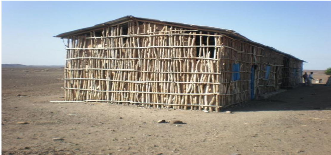
Photo 6: Berso School in Afar, with no playground fence and other facilities

What made the above finding more shocking is that the poor primary school facilities in the Afar region persists even after the fourth Ethiopian Education Sector Development Program (ESDP IV) launched and giving special support to the emerging regions and ensuring water supply, sanitation and hygiene for schools (MoE, 2010), and also after the implementation of the School Improvement Program (SIP) in Ethiopia since 2010. One of the packages in this program is devoted to improving learning environments for the learners and teachers (MoE, 2007). What is even more surprising is to see many reports stating that as problems related to school facilities are solved and as a result a comfortable educational school environment has been created in many parts of Ethiopia. However, the data obtained through interview and FGDs suggested that no school improvement program was implemented in this region, thus national priorities were not given due attention in the Afar region.