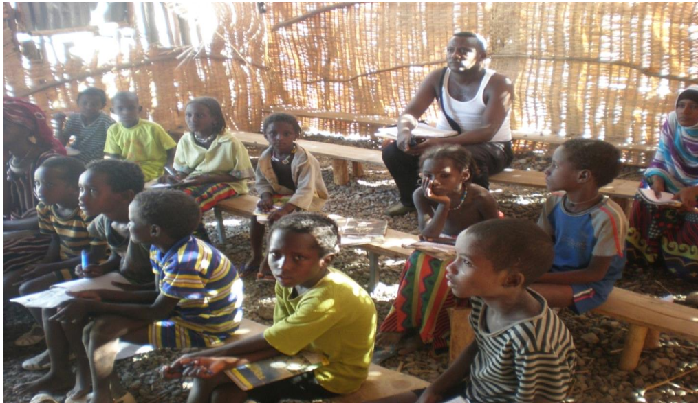
Photo 5: Students in a less attractive classroom at Berso School in Afar

Although I am the leader of this school, I can tell you that I am working until I get a better job. The most irritating problem we have here is shortage of water. We can tolerate shortage of other supplies for some days or weeks, but how can we live and work without water to drink in very hot weather? Once the government in collaboration with an NGO tried to supply us with water by digging a well. However, we did not use that water for more than a month because the well ran dry. Although we immediately reported the case, we got no answer and no one came back to see what happened. We want to do things by ourselves but we do not have the financial capacity or professional competence. ... There are multifaceted problems related to lack of water. For example, lack of interest to learn and high dropout rate. (SdA3)