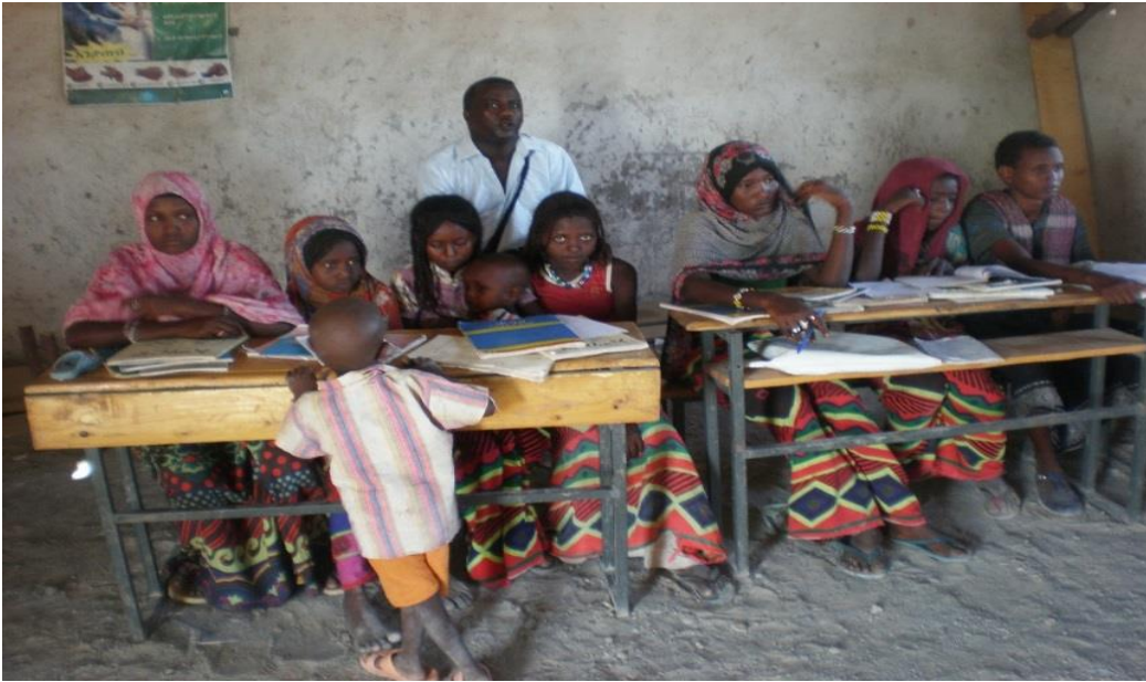
Photo 1: Dufti Arategna Ersha Tabia Primary School of Afar with a preponderance of girls in class