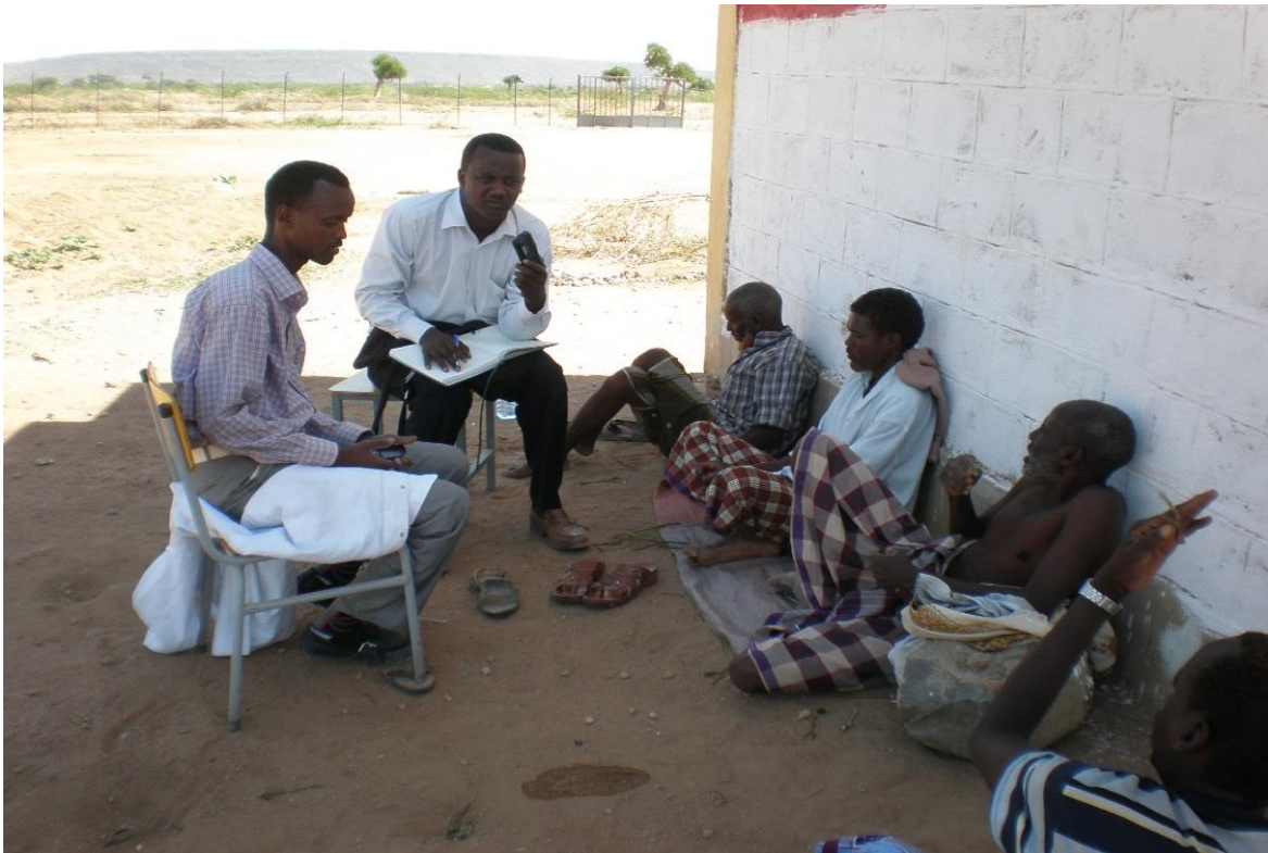
Photo 10: Interactive discussion with the PTA of Karbeje Primary School (Somali region)

The attendance sheets seen in the observed primary school showed a higher (on average 50%) rate of dropout in the Afar region. The reasons the teachers and PTAs gave for this included long distances to travel. The data clearly show that the distance between the children's homes and the school was detrimental to their attendance in primary education and thereby also to the effective achievement of EFA. Research and reports also indicated that travelling long distances was a major barrier to attendance at primary school in Tanzania (UNESCO, 2002) and the provision of education for the pastoralists of Africa.