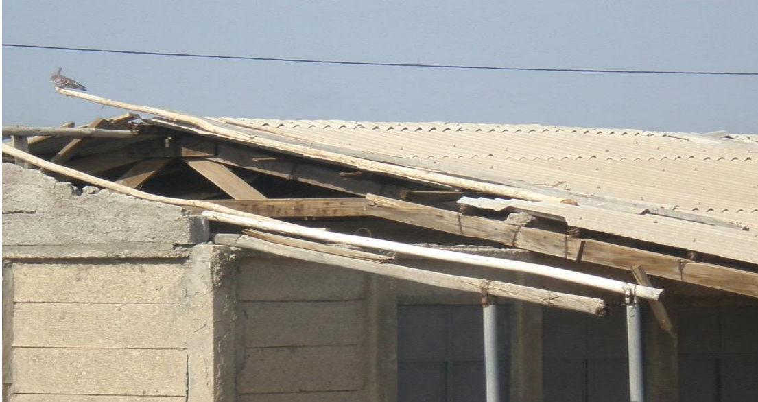
Photo 4: Serdo primary school in Afar with part of the room taken by the desert wind (built by SIDA in 1971)

the roof of this school partly destroyed by the desert wind. I have reported this to the woreda education office more than five times but there has been no response so far. Students are learning in this kind of classrooms suffering from the sun. We have a lot of problems but we have no educational leaders and political leaders who understand our problems and support us. (SdA5)