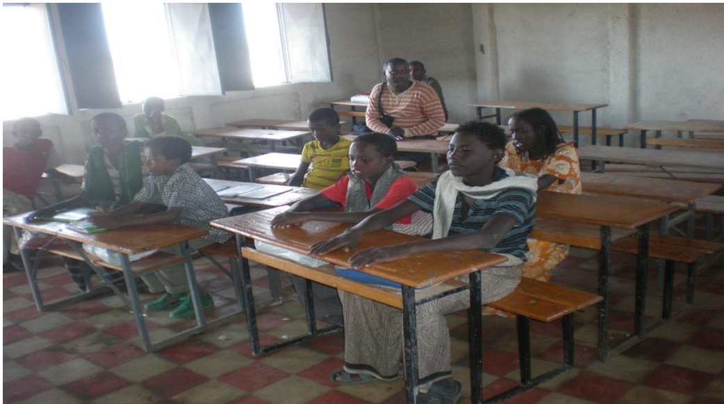
Photo 2: Serdo School in Afar, nearly half of the students dropped out

In the FGD, members of the PTA in one of the schools in the Afar region stated that the major reasons for lower attendance at primary schools in rural parts of Afar are less awareness on the value of education, lack of competent teachers, difficult climatic conditions, and poor support from family.