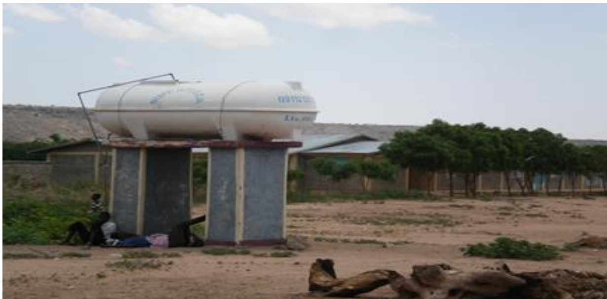
Photo 3: Tome school in the Somali region with water and a relatively good school compound

The primary school facilities in the Somali region are far better than in the Afar region. Participants mentioned that although there are some basic facilities, several things need to be done to make the school environment more comfortable and attractive. Data obtained through observation also confirmed the better school facilities (school compounds, chairs, tables and buildings) in the Somali region.