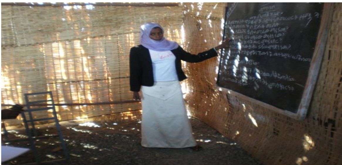
Photo 7: A teacher teaching science in Amharic at Dufti Arategna Ersha Tabia Primary School in the Afar region

One of the aspects of educational provision in primary education is the issue of the medium of instruction (McNab, 1988; 1990). National policies and international conventions state that children at the lower level of schooling, particularly in the lower primary school, have the right to learn in their own language (Smith, 2008). Using the mother tongue as a medium of instruction improves not only the motivation of the children to learn but also improves the comprehension of the subject matter (Cohen, 2007). Using the mother tongue as the medium of instruction has been given due attention in Ethiopia since the enactment of the Ethiopian education and training policy (FDRE, 1994).