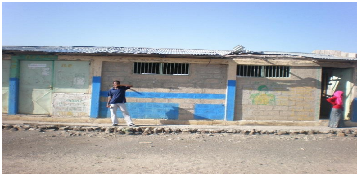
Photo 9: Harsis school in Afar region. Total drop out

Furthermore, observation and the photos taken from the nearby schools of Samara (the capital of Afar) showed that the vast majority of the students, particularly those who are seven and eight years old were unable to learn when the weather was too hot. This seriously affected attendance and might lead to total dropout in some schools, for example, in Harsis primary school. However, the participants noted a lack of flexibility in the academic calendar and programme.