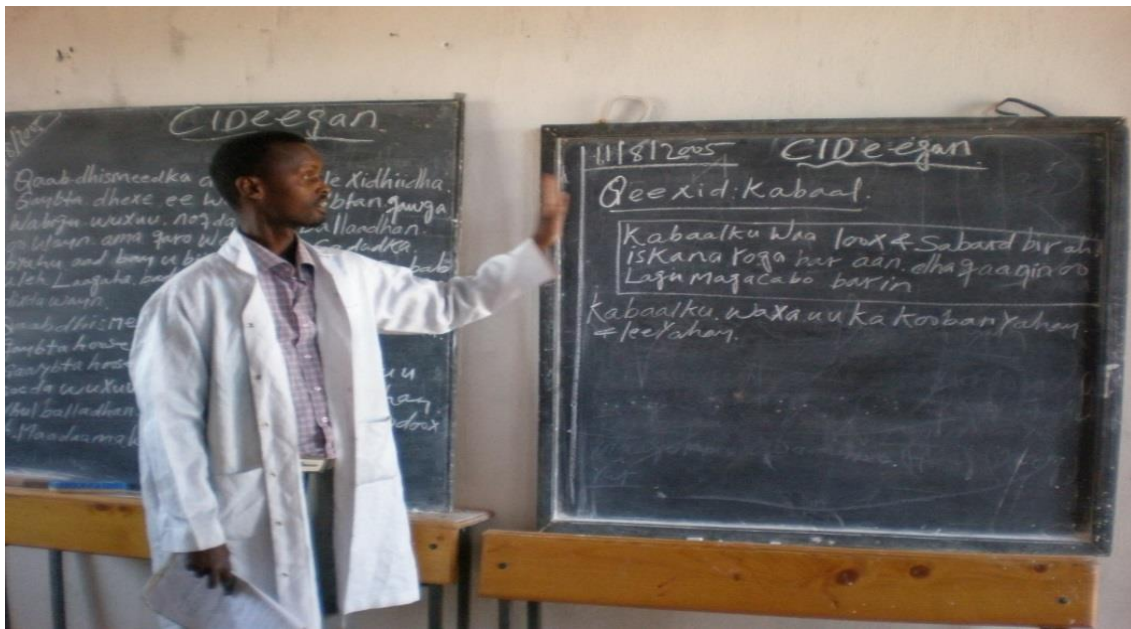
Photo 8: A teacher in the Somali region, Karbeje Primary School teaching in the children's mother tongue (Somali)

I remember students who started grade one with me twelve years ago and did not understand the language of instruction. They were not able to communicate with their teacher, and this made them feel discomfort and anger, and finally they dropped out of school. Students who came from non-formal education acquired their education in their own languages, but when they came for formal education things were not the same. The language of instruction was different from the one they knew and used in non-formal education and this made them frustrated and drop out of school. Now such things are history. All Somali children are learning in their own mother tongue. (USJ3)