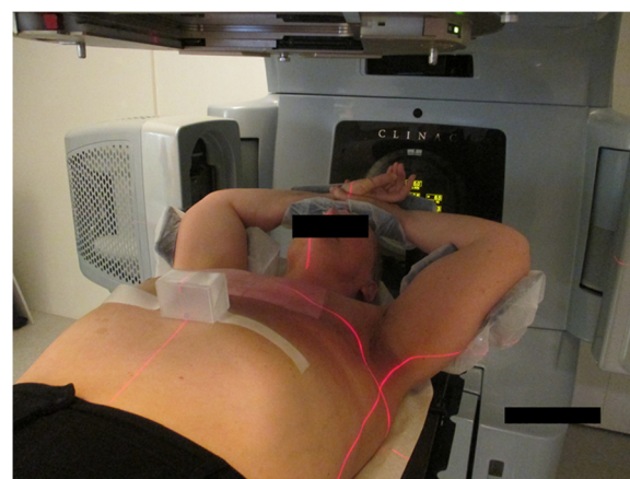
Figure 1 Patient fixation. The breast board is tilted by 5° and it has two arm support devices. The patient lies supine with both arms lifted above the head. The RPM marker block is taped to patient skin. The laser lines are aligned to three tattoo marks placed in free breathing on patient skin: two marks on both lateral sides and one on the sternum. There is also one mark on the abdomen to minimize patient rotation. After the laser alignment, translational shifts are performed to the treatment isocenter before the image guidance procedure.

A total of 67 consecutive left-sided breast cancer patients receiving adjuvant RT following breast conserving surgery were retrospectively investigated using offline analysis. Of these, 23 patients were treated for axillary and supraclavicular regions due to lymph node involvement. The mean patient age was 55 years. Patient fixation was carried out with Candor's ConBine fixation device (Candor, Gislev, Denmark) (Figure 1). A Varian RPM respiratory gating system, version 1.7 (Varian Medical Systems, Palo Alto, CA, USA) was used for respiratory monitoring. An RPM block with two dot markers was placed between the xyphoid process and the umbilicus (4.5 cm below the xyphoid on average, as previously reported [1,9]) to detect maximal anterior-posterior respiratory movement. Each patient was carefully informed about the breath-hold procedure. Before the planning CT, patients were audio coached to perform reproducible and stable breath-holds for periods of 12–15 s at least 4–5 times and one breath-hold exceeding 20 s. If these conditions were met, a gating window from \pm 2 to \pm 5 mm was set around the average BHL. The window width was chosen based on the upper and