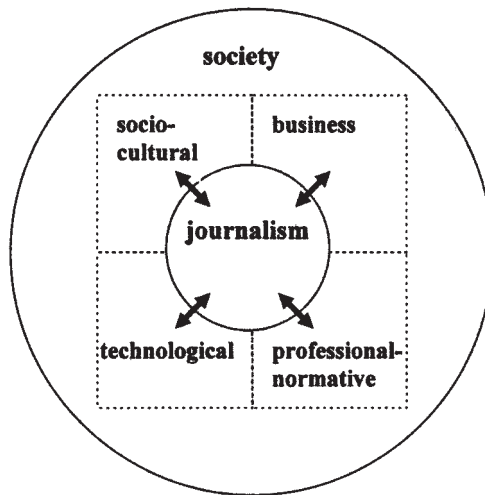
Figure 2.1. Reasonings of change in journalism.

consume the products of journalism. And not only that, but also the expectations towards journalistic performance vary in different social and cultural settings.