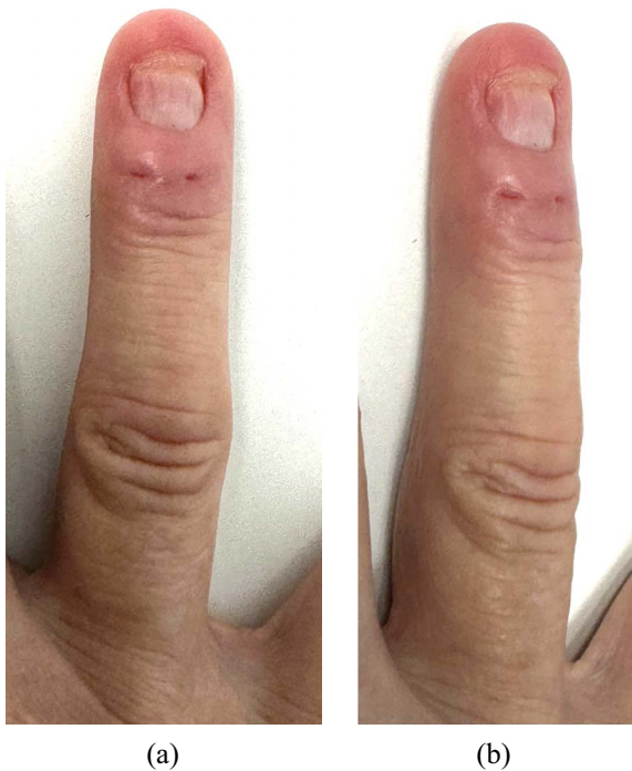
Figure 2. 3-months follow-up photos showing the excised digital pilonidal sinuses and the formation of a new healthy fingernail: A. dorsal; B. oblique.

all professions related to manual handling of hair including dog groomers.