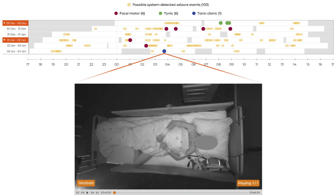
FIGURE 3 Graphical user interface view. Epochs detected by the algorithm (seizure candidate events) are depicted over a 6-day period with a lighter color and small squares. Three different types of seizures were identified by human annotators and marked by larger dots. The time of the day is represented on the x-axis. White background color refers to registration periods. The videos of the epoch can be reviewed by clicking on a dot (subwindow)