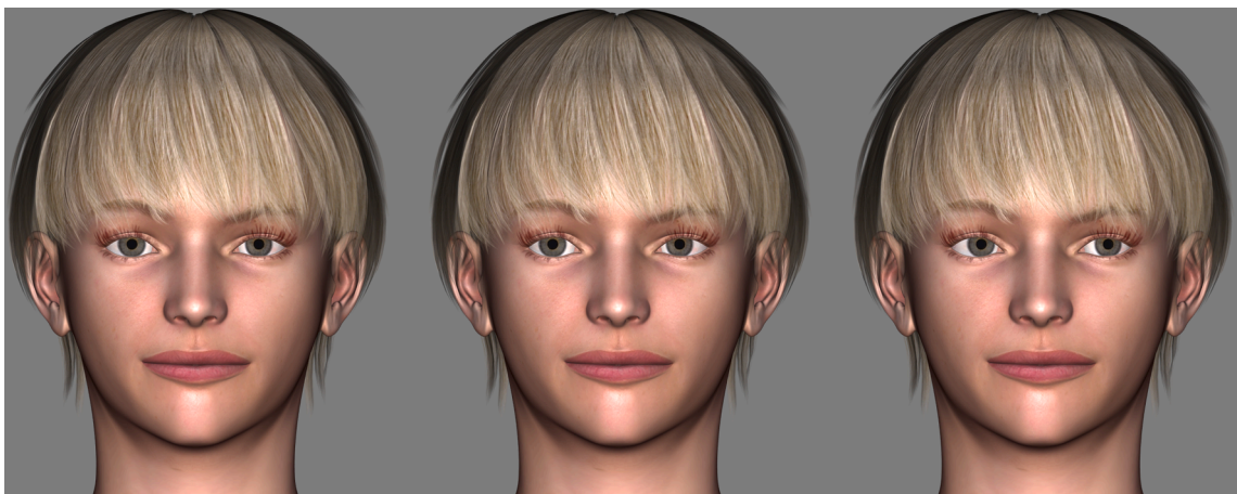
Fig. 1. Examples of the face stimuli. From left to right, the stimuli are portraying direct gaze, gaze averted 4^\circ to the left, and gaze averted 8^\circ to the right.

Each of the three tasks (self-referential thinking manipulation, gaze cone task, LIF) ended with an attention check item where participants were given explicit instructions on how to answer. At the end of the writing task, participants were presented with an additional text field and instructed to write "x" in it. In the gaze cone task, participants were presented with a deviated gaze and