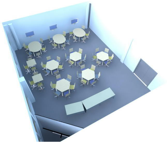
Figure 2. Design phase sketch of the furniture of the room.