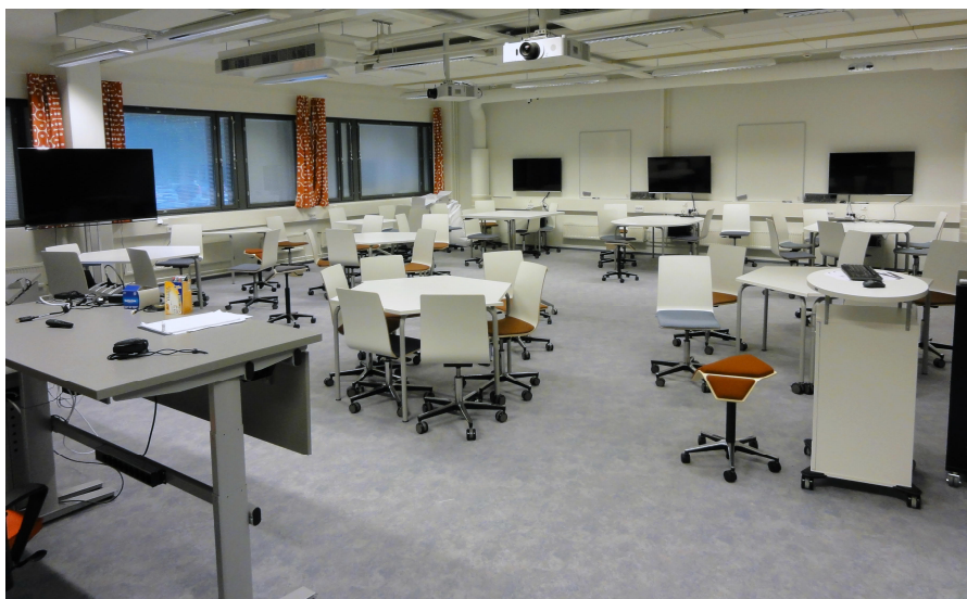
Figure 4. Room after the refurbishment.