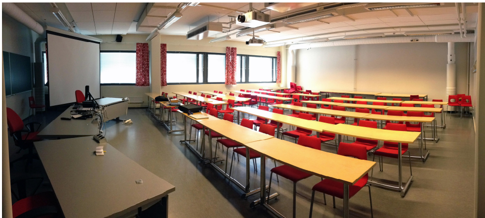
Figure 1. Picture of the room before the refurbishment.

The project team included a teacher (heading the project), department head, architect, senior laboratory engineer, and AV specialist. The team worked informally, everyone had a clear role. A teacher (the first author of this paper) was making sure that pedagogical aims were taken into account, also taking care of the project process. An architect (the second author of this paper) supported in the selection of furniture and materials, and prepared the needed drawings. The department head ensured the department aims to enhance teaching and learning, made financial decisions and hired the external constructors. A senior laboratory engineer advised in the planning of the room appliances and prepared the required plans for wiring of the room. An AV specialist commented on available software and hardware for video/audio.