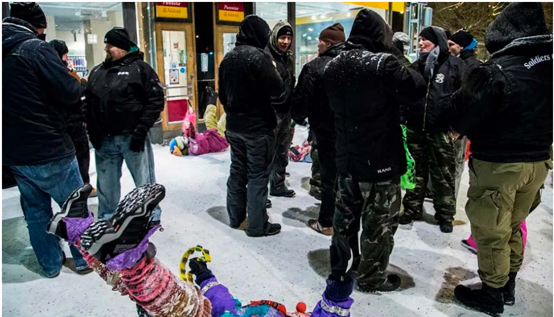
■ Figure 2. Loldiers of Odin (on ground) and Soldiers of Odin (standing), Tampere, Finland, 16 January 2016.