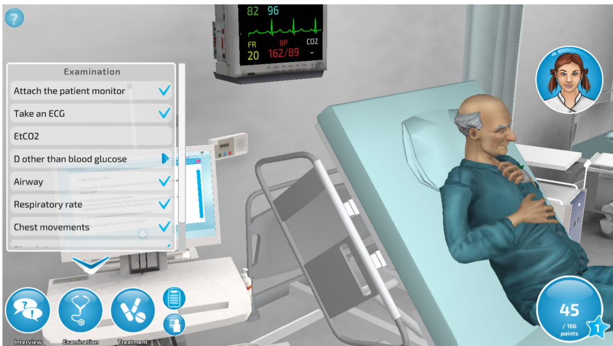
Fig. 1 Screenshot of the simulation game (English version)

Data on educational background were collected as background education since in Finland, eligible applicants for