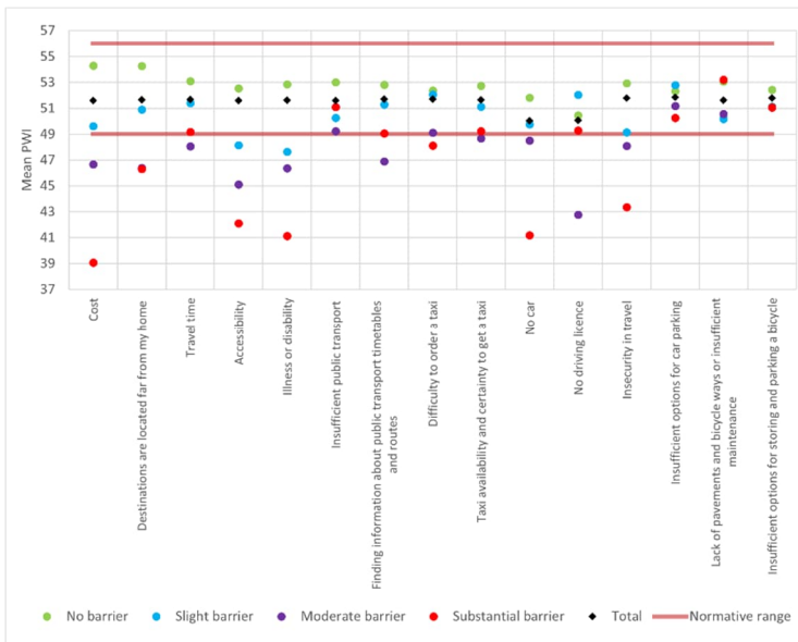
Figure 1: PWI means in the travel barrier items between different answer options