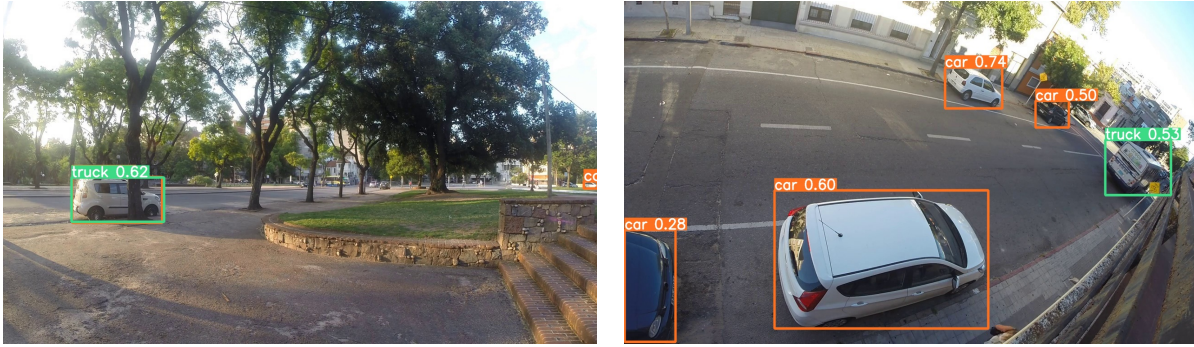
Figure 3: Example of mislabelled vehicles by YOLO.