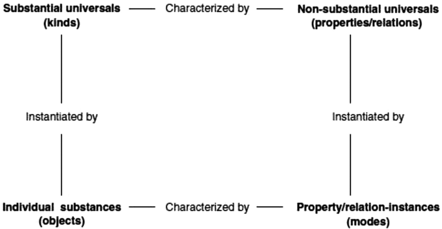
Figure 1. The ‘ontological square’, reproduced from Lowe 2006: 22.