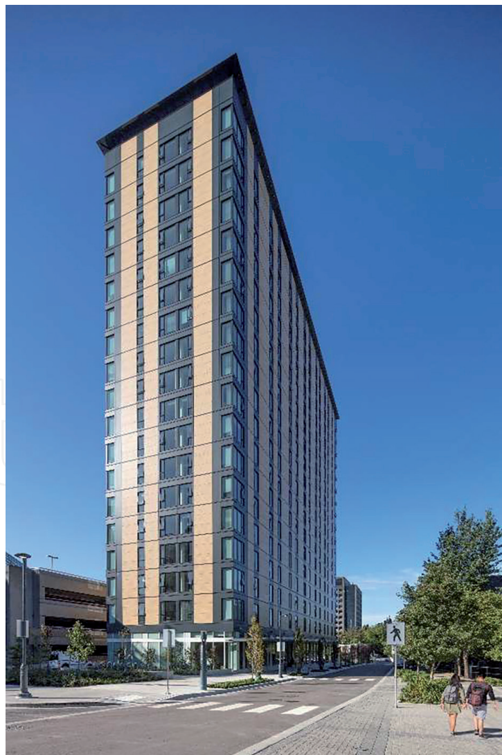
Figure 3. Brock Commons Tallwood House (Photo by Michael Elkan and courtesy of Acton Ostry Architects).