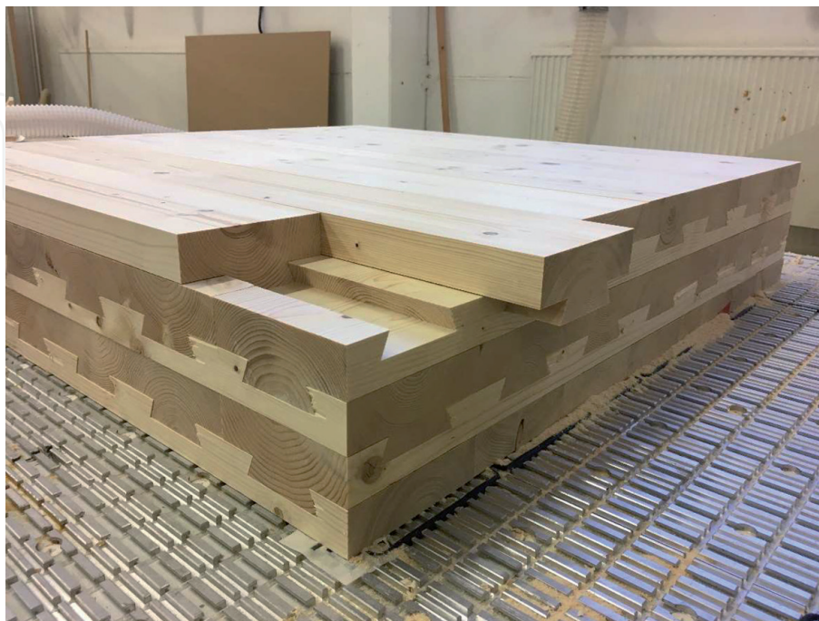
Figure 4. Adhesive- and metal fastener-free dovetail wood board element.

This study aimed to understand the contractors' perceptions of the use of wood for construction. In doing so, this chapter attempted to identify perceived major barriers to timber utilization. However, as the focus of conducted research among contractors differed as noted above, it was not possible to compare these studies with each other, but still, some conclusions were reached as follows: (a) their previous experience with concrete solutions, especially as a structural material, could have prevented them from conducting in-depth analysis for new materials; (b) building more wood and gaining more experience may not be enough to increase the popularity of wood construction; (c) lack of legal support, lack of industry interest, lack of experienced professionals, lack of education, perception of wood framing disadvantages, and limited awareness of wood framing advantages as well as the perceived