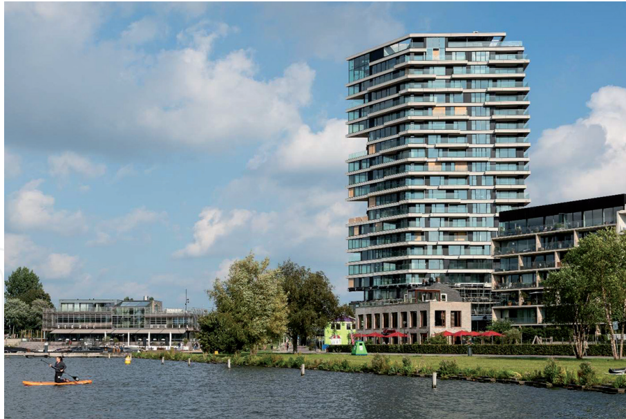
Figure 2. HAUT.