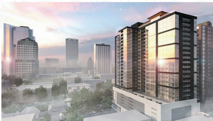
Figure 1. Ascent (Image courtesy of Jason Korb/Korb + Associates Architects).

Wooden buildings are characterized by a lower carbon construction concept than non-wood buildings [22–26], and timber construction represents a lower embodied energy consumption compared with steel and concrete production [7]. Wooden structures provide significant advantages in combating climate change, because wood can be used as an alternative to other materials to reduce greenhouse gas emissions, but also has unique features such as storing large amounts of carbon in the structure [27, 28]. For example, estimated environmental impact of wood use in Brock Commons Tallwood House ( Figure 3 ) was calculated as 1753 metric tons of CO 2 in terms of carbon stored in the wood [29]. Besides being used as a building material during the construction, wood can be reused as a raw material for other structures after the building's service life or, as a last resort, burned