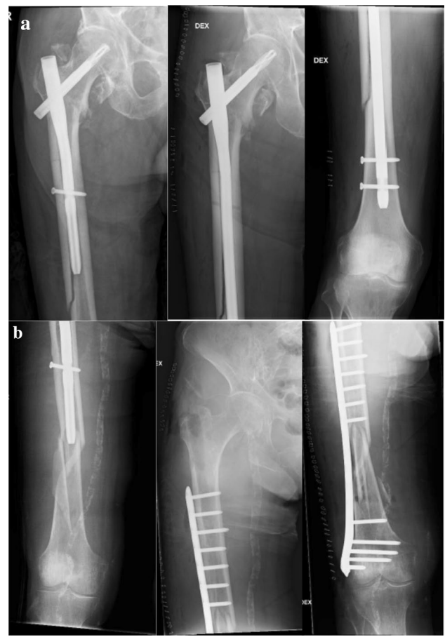
Fig. 2 Peri-implant fracture treated with nail removal and a exchange nailing to a long PFNA. b Open reduction and internal fixation with a locking plate

None of the patients needed additional surgeries for malunion, non-union, or delayed union after the initial surgery for the PIF. One patient had a post-operative surgical site infection after salvage treatment treated with a series of surgical debridements and intravenous antibiotics. The mortality after PIF was 7% at 30 and 90 days, 29% at 1 year, and 43% at 2 years. As a comparison, mortality after initial trochanteric fracture was 7% at 30 days, 14% at 90 days, 26% at 1 year, and 35% at 2 years, respectively.