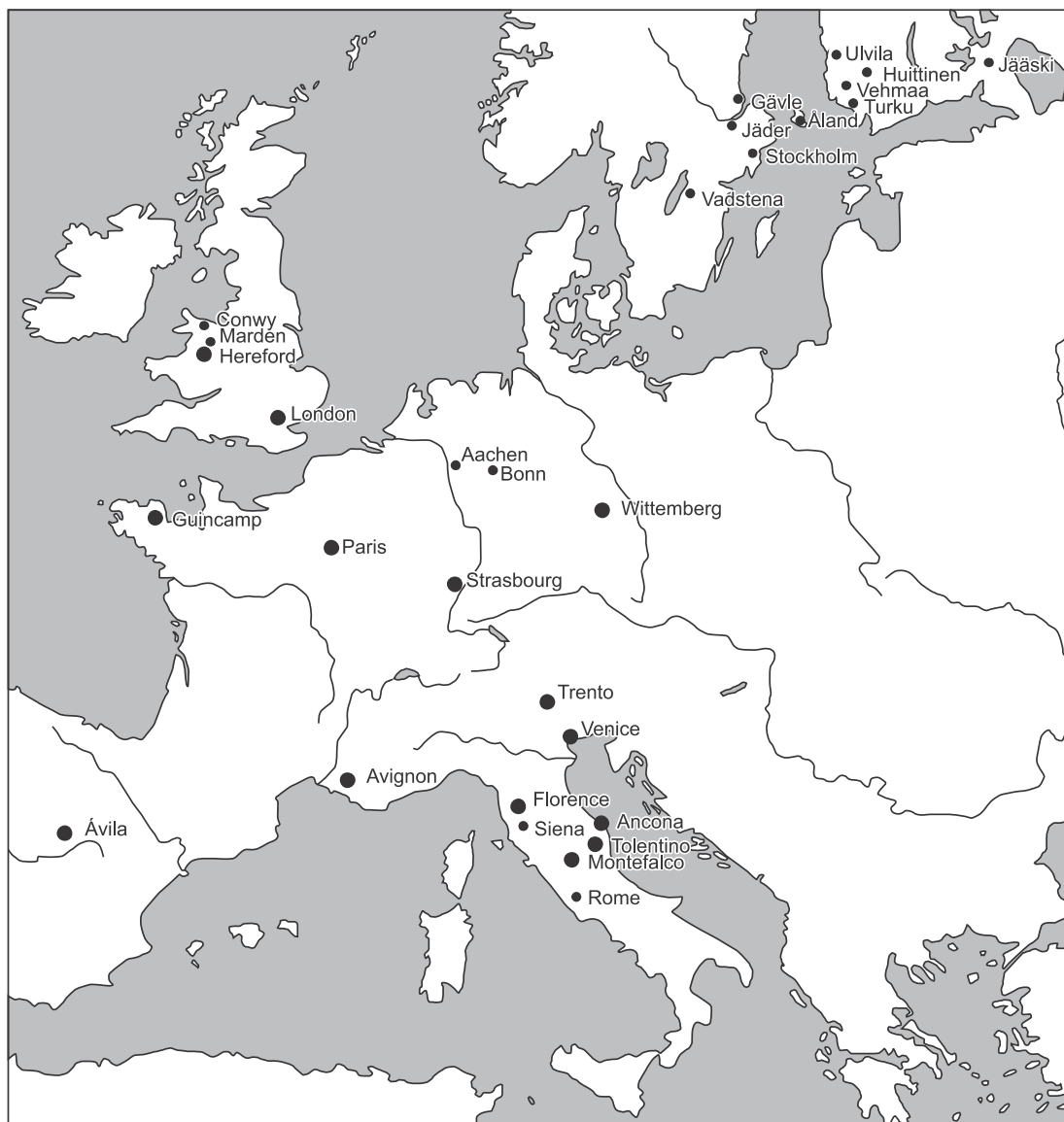
MAP 0.1 Locations of the major cases analysed in Lived Religion and Gender in Late Medieval and Early Modern Europe