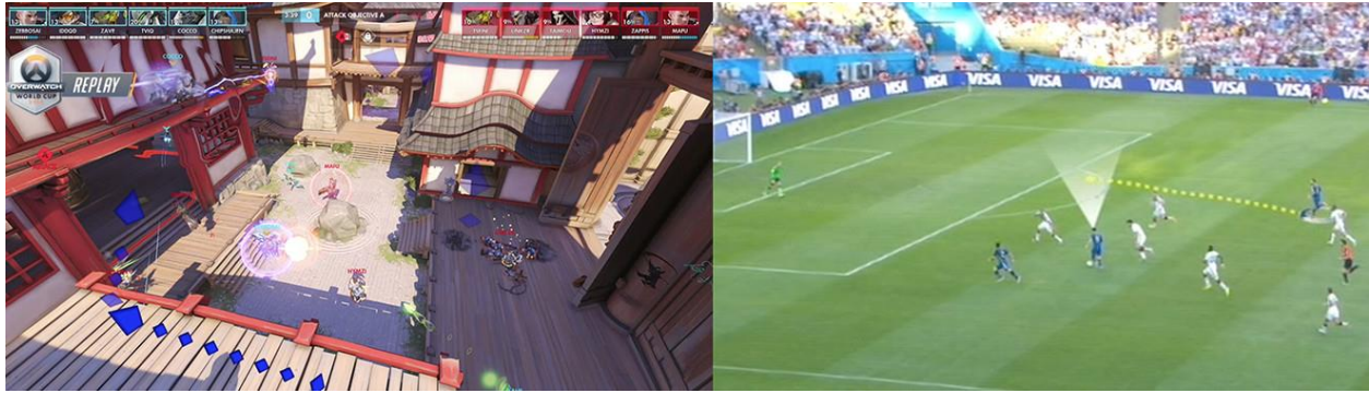
Figure 2. Game analysis: on the left, the Overwatch World Cup 2016 broadcast bronze medal match Sweden–Finland, and on the right, the 2014 FIFA World Cup final match broadcast Germany–Argentina (Yle TV2, Finland). Notice the similar use of arrows in both presentations.

In the Overwatch broadcast, two types of statistics are shown between individual games: “Hero Use Stats,” presenting all the relevant numbers (damage done, kills achieved, number of deaths, etc.) from one hero played by one player in the previous game, and “Head to Head” (team vs. team) numbers from the previous game. As these statistics are shown on the screen, the casters usually comment them. This is a common way to share information in televised sports in general (Figure 3). In traditional team sports, in addition to head-to-head-like statistics, all-time records and high scores (between different players and league teams or national teams) are usually mentioned in the broadcasts. At least so far, there seems to be a lack of these kind of general statistics in eSports—probably at least partly related to the constant patching, which induces changes in the games, greatly affecting the power of individual characters and team compositions and making it difficult if not impossible to compare individual player performances between various patches. In the FIFA broadcast, statistics also show other interesting details not directly related to game points—for example, that the German midfielder Bastian Schweinsteiger runs almost 14 km during the match.