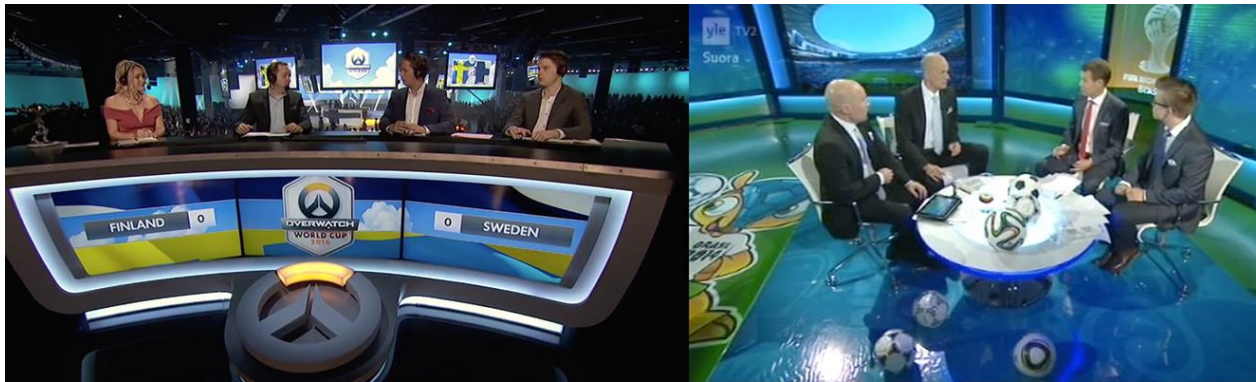
Figure 1. The World Cup studios: on the left, the Overwatch World Cup 2016 broadcast bronze medal match Sweden–Finland, and on the right, the 2014 FIFA World Cup final match broadcast Germany–Argentina (Yle TV2, Finland).

form of hegemonic masculinity born from a combination of traditional masculinity, athletic masculinity, technological expertise, and gaming performance (Lockhart, 2015; Taylor, 2012; Voorhees, 2015; Witkowski, 2012a).