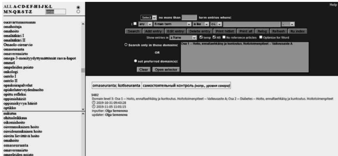
Fig. 10. The Main Window of the MyTerMS Dictionary Writing System

MyTerMS performs all basic operations that can be expected from dictionary management software, such as adding, editing, searching, browsing, printing, and deleting entries. It also automates many operations. For example, while adding a number of entries belonging to the same domain, it is possible to prefill the domain field instead of selecting it manually every time. MyTerMS also helps ensure the integrity of the data, for example, by preventing duplicate entries and automatically managing cross-references. In addition, it ensures the correctness of the input by performing a compliance check before saving the data.