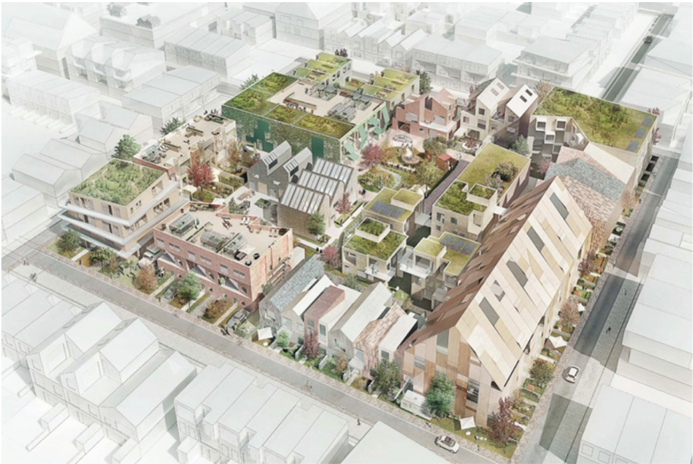
Figure 1. Naerheden project as inspirational material from architects at the beginning of the workshop (Karres en Brands and Arkitema 2016).

The superblock idea (Figure 2) contested the current urban development regime on several fronts. Finnish residential areas outside city centres are usually built primarily just for housing. They are also built in stand-alone building style, not in a city-block structure. The idea of denser urban fabric, instead of separate buildings, brought forward a new idea in residential planning, enabling mixed-use development and a rich set of amenities. Furthermore, Finland has a strong history of inclusive cities, based on the ideas of the welfare state. This idea has not vanished in recent years, but declining municipal tax revenues have steered the development in a more market-oriented direction. The superblock discussion challenged this development by proposing an inclusive idea of varied housing tenures at the rather dense block level: owner-occupied, rental, co-housing, right of occupancy, and cooperative housing.