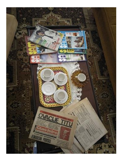
Figure 1. A 'typical' Yugoslav living room in the Museum of good memories