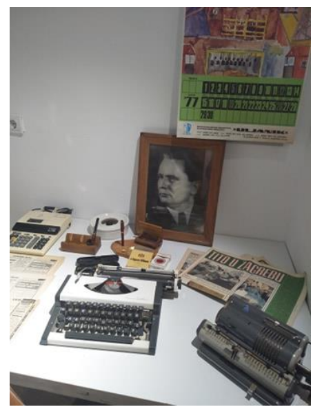
Figure 4. A 'typical' Yugoslav working desk with a picture of Tito