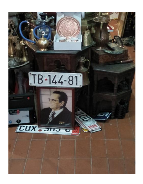
Figure 7. Yugoslav car plates and a photograph of Tito at an antique shop in Sarajevo

An interesting observation of the remnants of the Former Yugoslavia are the old graffities, also known as 'parole<sup>17</sup>', on the old houses across the region of Istria, Croatia. 'Parole' across the region were inscribed by the citizens of Istrian towns during and after World War II. After Josip Broz Tito, the leader of Partisans, defeated Benito Mussolini, the Istrian peninsula was connected with Yugoslavia by the Memorandum of London in 1954 (Altin & Minca,2018,p.112)<sup>18</sup>. This saw a mass exodus of Istrian Italians and those who did not want to go back to fascism, expressed their commitment to Tito and Yugoslavia through various graffities which were inscribed on houses. Animal blood was used for writing as well as normal paint. Many graffities read: "We want Tito!" and "Long Live Yugoslavia, Tito and Stalin!" <sup>20</sup>.