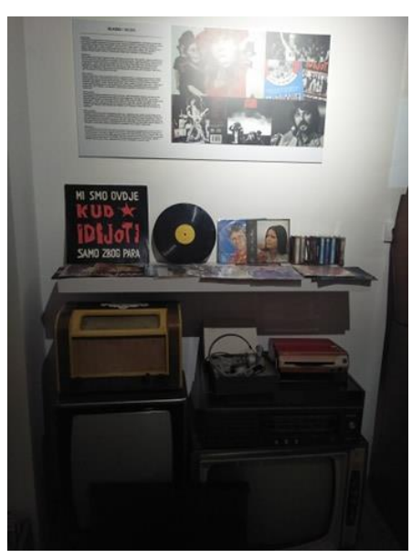
Figure 3. A collection of music from Former Yugoslavia