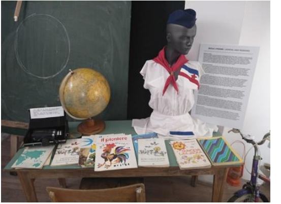
Figure 5. Collection of the pioneer's song books and magazines read by children across former Yugoslavia. Photo also showcases a typical pioneer uniform