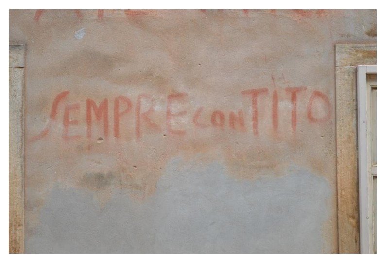
Figure 8. Graffiti with an inscription: "Sempre con Tito". Translates into "Always with Tito"