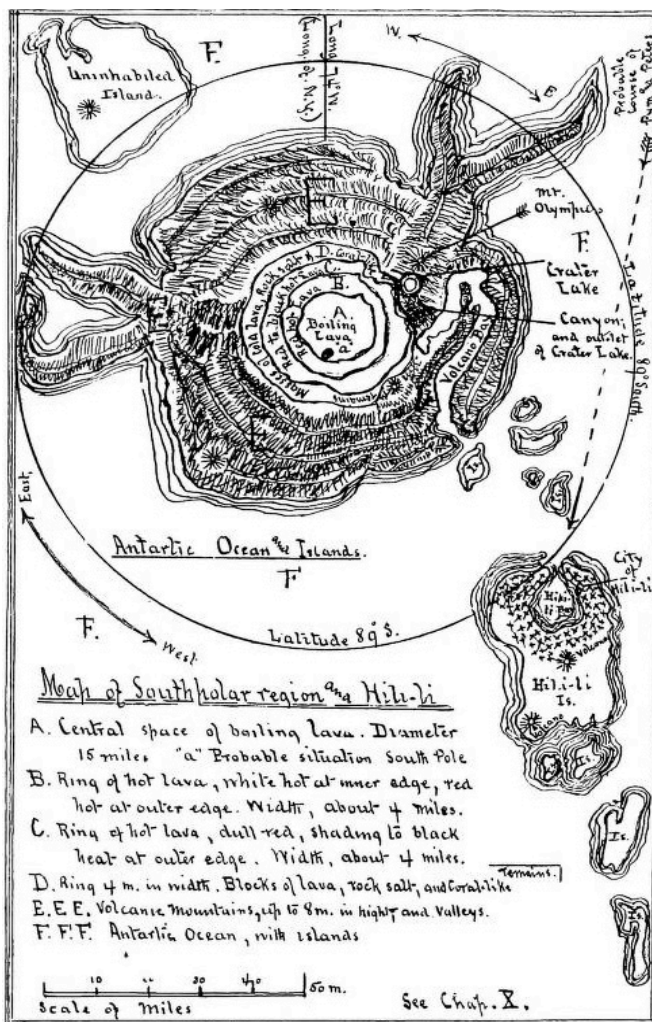
Figure 1: The Antarctic archipelago in Charles Romyn Dake’s A Strange Discovery (1899)

Other creative re-mappings of the polar regions are more overtly political. Thus, a map entitled ‘Denmark’ (2004) by Inuk Silis Hoegh and Asmund Havsteen-Mikkelsen shows Denmark as a Greenlandic colony (Figure 2). The map depicts Qallunaat Nunaat (‘the land of the white people/Danes’) as an Arctic archipelago with mountains and ice sheets that resemble those of Greenland. Its archipelagic appearance is underscored by the fact that the Jutland peninsula is cut off from continental Europe, and the Swedish mainland does not appear (instead, we only see the blue sea). The cities, seas, ice sheets, glaciers, and coastal regions carry the names of well-known Greenlandic personalities from different time periods, such as politicians and artists, while others are given a range of other Greenlandic names, sometimes with the Danish names written added in small letters and in brackets, inverting Danish colonial naming and mapping practices. Copenhagen, for instance, is renamed as “Nunap Utsussua” (‘The Land’s Great Vagina’), mockingly evoking figurations of colonial lands as female bodies. Two small islands on the west coast of