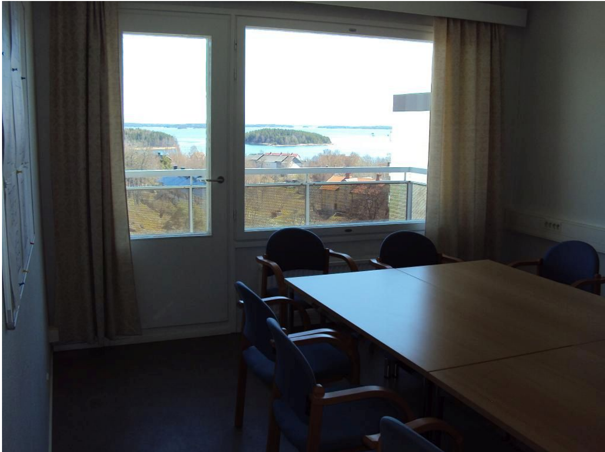
Picture 1. A meeting room in an archipelago work location