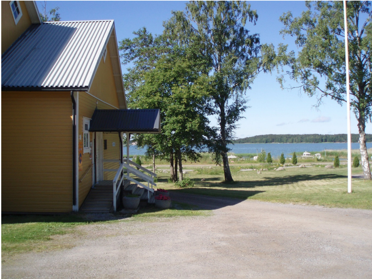
Picture 2. A historical town hall functioned as an archipelago work facility -----