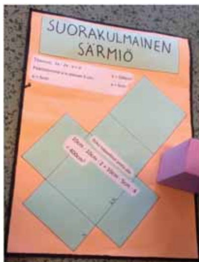
Figure 3. The demonstration of a right rectangular prism as a part of the project named the shape of food casing.

The project in Figure 3 is a good example of using the four languages. The team examined a right rectangular prism as a part of the project. Pupils clearly used mathematical symbolic language, pictorial language, and tangible language. Additionally, they presented their work orally.