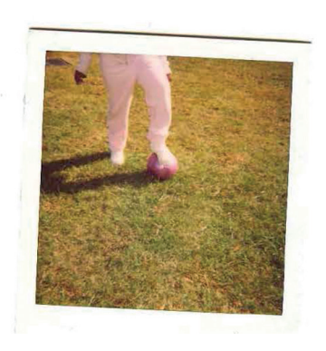
Figure 2. Jasmine's Soccer Picture and Story<sup>1</sup>.

When I was playing sooder. I Did tricks With my feet, I can do tricks like Zig Zag inthe grass, I can move my feet straight, curved right, least. That's way I lik my teet