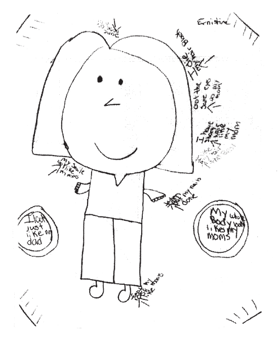
Figure 1. Brainstorming the Best Part of Me

for example some students explained that "my feet are for kicking a soccer ball" or "my eyes are blue just like my grandfather's".