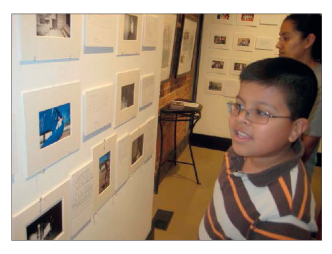
Figure 4. Students' Community Photography Exhibit