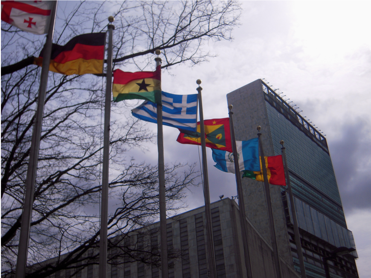
The UN headquarters in New York City in March 2011