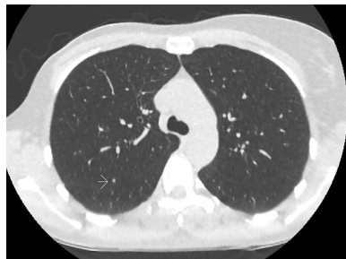
Figure 2. Ultra-low-dose CT (ULD-CT) image of a patient for whom radiologist considered the ULD-CT finding diagnostic and verification with normal dose contrast enhanced CT unnecessary. Slice shows one of the four metastatic nodules of all which were invisible in chest X-ray.