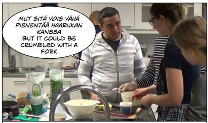
PIC 4: INSTRUCTOR'S GESTURE DEPICTS THE ACTION OF CRUMBLING THE CHEESE AND IS PERFORMED ON TOP OF THE CHEESE POT