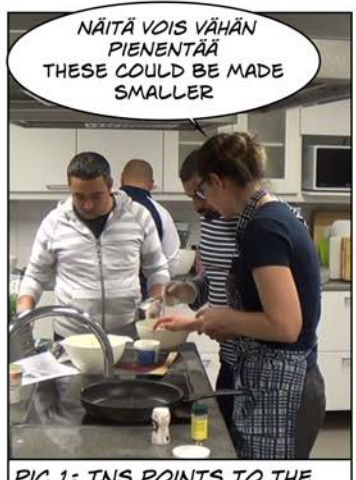
PIC 1: INS POINTS TO THE FETA CHEESE