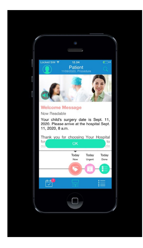
FIGURE 2 Buddy care solution for parental use

Triumf includes a novel platform that is deployed as a digital intervention to reach out to paediatric patients through a game environment. The solution delivers digital therapeutics through a mobile game environment. Digital therapeutics (DTx) is defined as evidence-based, clinically evaluated therapeutic interventions delivered through software (Digital Therapeutic Product, 2020). The solution was primarily developed to improve the mental well-being and quality of life of children and early adolescents (7–14 years of age). The platform has been co-designed with children with and without health issues, their parents and care teams from Finland and Estonia to develop a solution that has a maximum impact and is universally applicable to burdening factors. The game environment provides a medium for delivering comprehensive care that is familiar, safe and intuitive to children. This is an important characteristic of user-centred digital solutions and is central to the methodology for