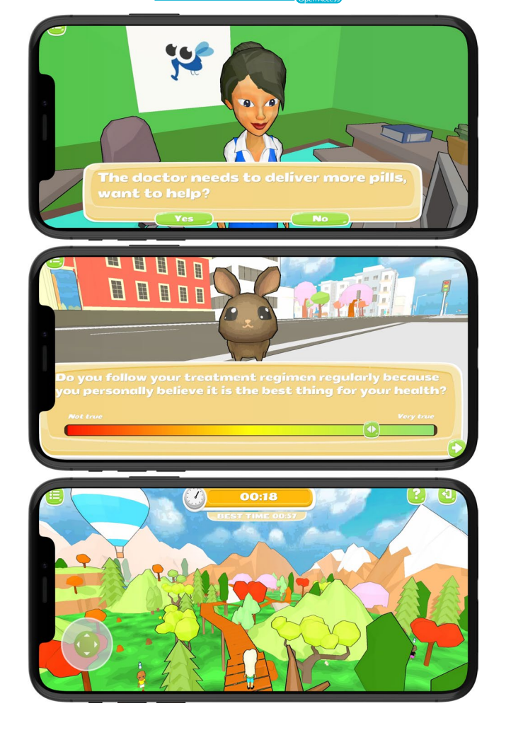
FIGURE 3 TriumfHealth, the gamified mobile health intervention for children in the intervention group

by the paediatric surgeon. During the appointment, the parents and child will receive primary information concerning the procedure in the day surgery unit once the need for surgery has been identified