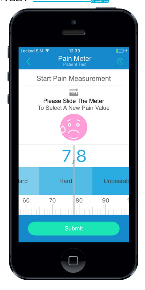
FIGURE 4 Modified Pain Meter in BuddyCare solution

and sense of community (Högberg et al., 2019). The children will respond to the questions using a seven-point Likert scale (1 totally disagree–7 totally agree). The GAMEFULQUEST demonstrated good reliability and validity (Cronbach's alpha 0.87–0.92, convergent validity AVE \geq 0.5) and the development and validation of the full GAMEFULQUEST measurement has been reported by Högberg et al. (2019).