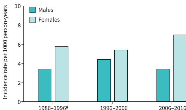
FIGURE 2 Incidence rate of physician-diagnosed asthma by sex for three decades, from 1986 to 2016. Incident cases were defined by model A in all cohorts. Model A: excluded from population at risk were those who at baseline reported physician-diagnosed asthma, ever-asthma, current use of asthma medicine and recurrent wheeze. #: LUNDBÄCK et al. [15].

In line with previous studies, we found that women had a higher incidence of adult-onset asthma compared with men (figure 2) [12–24, 29, 30]. This is in contrast to children, where the incidence is higher among boys than girls [8, 9, 11, 22]. The reason for the sex differences is unclear but may be related to hormonal status [29]. The obese-asthma phenotype, often found in adult-onset asthma among women [5, 29], may be mediated by interactions between sex hormones and systemic inflammation [31]. Female sex has also been