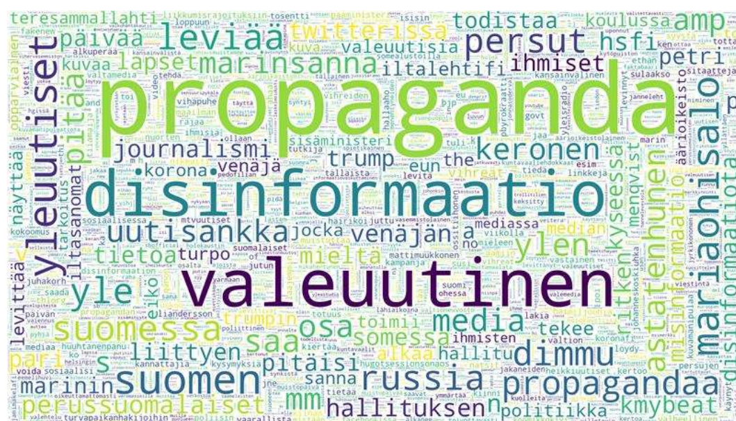
Figure 1. Word cloud of tweets.

As seen from the word cloud propaganda, valeutinen (fake news), disinformaatio (disinformation), yleutiset (Yleisradio, “Yle”, is the Finnish Broadcasting Company, uutiset means news), Suomen (Finland’s), suomessa (in Finland), mariaohisalo (Maria Ohisalo is the Minister of the Interior of Finland), perussuomalaiset (Finns Party), persut (slang for Finns Party), Russia, venäjän (Russia’s), venäjä (Russia), and the Finnish Prime Minister Sanna Marin spelled in various ways (e.g., marinsanna, marin, marin) are among the biggest terms. From the processed tweet text (according to Table 2) of the word cloud, the top 30 most frequently used words are listed in Table 4.