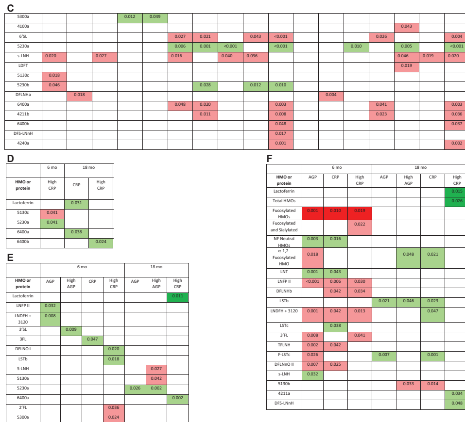
FIGURE 1 Associations of human milk oligosaccharides (HMOs) and bioactive proteins at 6 mo with infant morbidity and markers of inflammation in 659 Malawian mother-infant dyads: morbidity outcomes in all participants (A) for milk constituents that did not differ between secretors (positive for the functional enzyme encoded by the FUT2 gene) and nonsecretors; morbidity outcomes in secretors (B) and nonsecretors (C) for milk constituents that differed between secretors and nonsecretors, or for which there was a significant interaction between the milk constituent and secretor status; markers of inflammation in all participants (D) for milk constituents that did not differ between secretors and nonsecretors; markers of inflammation in secretors (E) and nonsecretors (F) for milk constituents that differed between secretors and nonsecretors, or for which there was a significant interaction between the milk constituent and secretor status. Only shown are the milk constituents that were significantly associated with \geq 1 of the outcomes. HMOs are ordered from highest to lowest relative abundance. Associations of outcomes with the bioactive proteins, total abundance of HMOs, and relative abundance of fucosylated HMOs and sialylated HMOs were considered primary analyses. All others were considered exploratory analyses. For the associations of morbidity outcomes, P values were determined by negative binomial models using continuous morbidity data for all associations except incidence of fever and diarrhea from 6 to 7 mo, which were calculated using logistic regression with binary morbidity data. For the associations of markers of inflammation, P values were determined by multiple linear regression models for continuous AGP and CRP data and logistic regression for binary outcomes. P values are from models that were adjusted for covariates, with a level of significance <0.05 . Associations in dark green are primary analyses that were in the positive direction and remained significant after the Benjamini–Hochberg correction for multiple hypothesis testing. Associations in light green are exploratory HMOs that were in the positive direction or primary analyses that did not remain significant after correcting for multiple hypothesis testing. Associations in pink are exploratory HMOs that were in the negative direction. Associations in red are primary analyses that were in the negative direction and remained significant after the Benjamini–Hochberg procedure. HMOs identified by numbers have not been previously named. Their composition is given as hexose_ N -acetylhexoseamine (HexNAc)_fucose_ N -acetylneuraminic acid (sialic acid). For example, 5311 has 5 hexoses, 3 HexNAc, 1 fucose, and 1 sialic acid. Thus, those with a nonzero number in the last position are sialylated; those with a nonzero number in the third position are fucosylated. AGP, \alpha -1-acid glycoprotein; ARI, acute respiratory infection; CRP, C-reactive protein; DFLNH(a,b,c), difucosyllacto- N -hexaose (a,b,c isomers); DFLNnO, difucosyllacto- N -neooctaose; DFLNO, difucosyllacto- N -octaose; DFpLNH, difucosyl- para -lacto- N -hexaose; DFS-LNnH, difucosylmonosialyllacto- N -neohexaose; F-LNO, fucosyllacto- N -octaose; F-LST, lactodifucotetraose; LNDFH, lacto- N -difucohexaose; LNFP, lacto- N -fucopentaose; LNH, lacto- N -hexaose; LNnH, lacto- N -neohexaose; LNT, lacto- N -tetraose; LST(a,b,c), sialyllacto- N -tetraose(a,b,c isomer); MFLNH, monofucosyllacto- N -hexaose; MFpLNH, fucosyl- para -lacto- N -hexaose; NF, non-fucosylated; p-LNH, para -lacto- N -hexaose; s-LNH, monosialyllacto- N -hexaose; S-LNnH, sialyllacto- N -neohexaose; TFLNH, trifucosyllacto- N -hexaose; 2'FL, 2'-fucosyllactose; 3'FL, 3'-fucosyllactose; 3'SL, 3'-sialyllactose; 6'SL, 6'-sialyllactose.