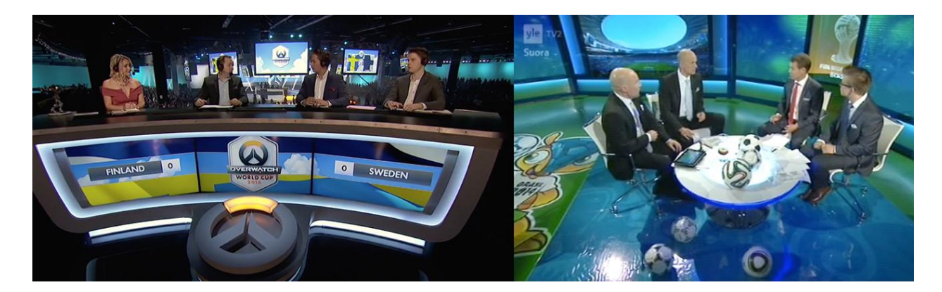
Figure 1. The World Cup studios: on the left, the Overwatch World Cup 2016 broadcast bronze medal match Sweden–Finland, and on the right, the 2014 FIFA World Cup final match broadcast Germany–Argentina (Yle TV2, Finland).

form of hegemonic masculinity born from a combination of traditional masculinity, athletic masculinity, technological expertise, and gaming performance (Lockhart, 2015; Taylor, 2012; Voorhees, 2015; Witkowski, 2012a).