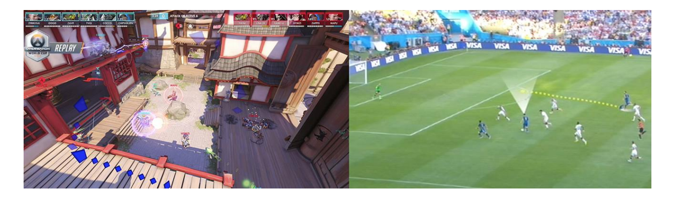
Figure 2 . Game analysis: on the left, the Overwatch World Cup 2016 broadcast bronze medal match Sweden–Finland, and on the right, the 2014 FIFA World Cup final match broadcast Germany–Argentina (Yle TV2, Finland). Notice the similar use of arrows in both presentations.

In the Overwatch broadcast, two types of statistics are shown between individual games: "Hero Use Stats," presenting all the relevant numbers (damage done, kills achieved, number of deaths, etc.) from one hero played by one player in the previous game, and "Head to Head" (team vs. team) numbers from the previous game. As these statistics are shown on the screen, the casters usually comment them. This is a common way to share information in televised sports in general (Figure 3). In traditional team sports, in addition to head-to-head-like statistics, all-time records and high scores (between different players and league teams or national teams) are usually mentioned in the broadcasts. At least so far, there seems to be a lack of these kind of general statistics in eSports—probably at least partly related to the constant patching, which induces changes in the games, greatly affecting the power of individual characters and team compositions and making it difficult if not impossible to compare individual player performances between various patches. In the FIFA broadcast, statistics also show other interesting details not directly related to game points—for example, that the German midfielder Bastian Schweinsteiger runs almost 14 km during the match.