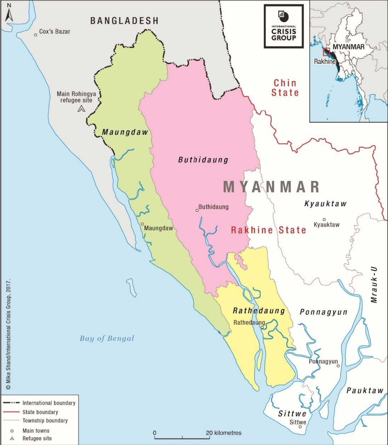
Figure 1: Myanmar-Bangladesh Border