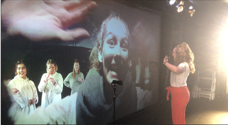
Figure 3. Coventry and Tampere students greet each other in Godot Online 2020

Over the five years of the project we have continued to refine both the technology and pedagogy that involves teaching in mediated spaces such as these. The traditional teaching methods that we would use in a live space had to be slightly adjusted to cope with this semi-digital method. At the beginning of the process it is tempting for the tutor to focus on the participants onscreen as this object is such a dominant presence in the space. One also gets the initial sense that these onscreen students are international visitors to your ‘home space’ and not just one half of the whole group. We found it necessary to try and psychologically overcome the temptation to deliver everything to the screen at the expense of ignoring the home students. The optimal position for the tutor in this space became either at the side of the group standing diagonally so that both groups could view his/her face or standing at the back of the space (Figure 4).