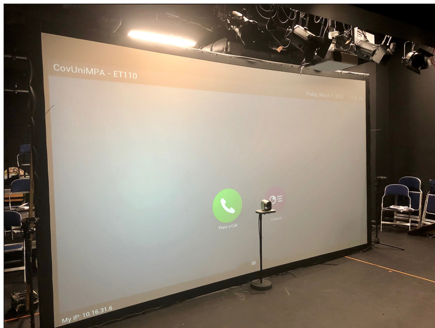
Figure 1. Set up of screen with camera slightly above waist height 7

Adobe Connect was also used to give each scene group (consisting of two Tampere and three Coventry students) their own individual ‘rooms’ to work independently on their scenes. Facebook was also utilised for scheduling details, sharing research materials, and to provide a quick way for students in each location to share photographic and video material of the ongoing work.