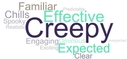
Fig. 4. Adjectives used to describe the “heartbeat” signal

When asked “What surprised or was novel to you?” or “Tell me about an experience that stands out to you,” popular