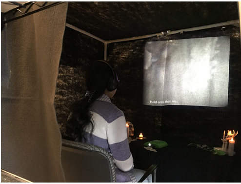
Fig. 2. A participant sits inside the haunted house