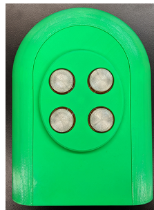
Fig. 1. The palmScape apparatus

The narrative of our haunted house was inspired by a séance, a form of ghostly entertainment popular in the 19th century [3]. In a séance, a medium instructs participants to sit in the dark, join hands, and attempt to communicate with