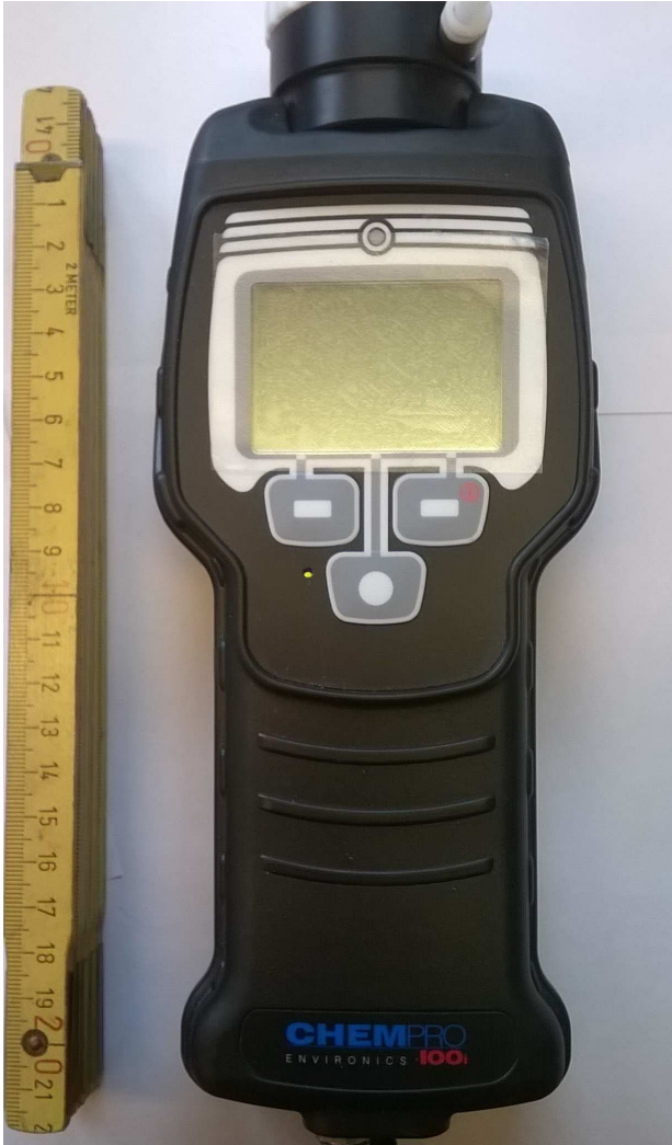
Fig. 1: ChemPro100i handheld chemical detector from Environics with ruler showing values in centimetres.