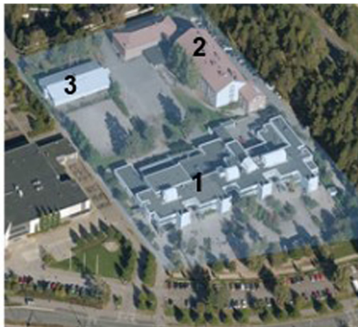
Figure 1. The case-campus is light-coloured and the numbered buildings are (1) the white building, (2) the brick building and (3) the pavilion