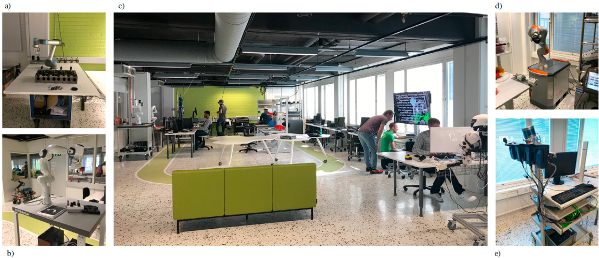
Fig. 2. (a) UR5; (b) Franka Panda; (c) Tampere RoboLab (center); (d) KUKA Iiwa; (e) Sensor rack.

backgrounds and provide a holistic view to the subject. Students can then focus their studies at certain direction by elective studies or majoring in a different discipline in the different fields of robotics. To support this a specific major in Robotics was formalised. A student majoring on Robotics will achieve knowledge of and ability to analyse fundamental computational methods relevant to robotic manipulators and mobile robots, including modelling, planning, localisation, and control, and experimentation on real robot platforms. The courses in this major in general train the student to use SW tools such as Robot Operating System (ROS), Matlab and Simulink. Regardless the selection of additional/complimentary courses, all of the participants will design and implement a simple robotic system including hardware and software solutions.