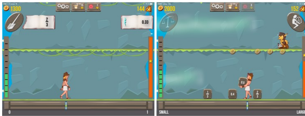
Figure 1. Left chart: An example of a number line estimation task in which the player should dig up a coin cache at the location reflecting \frac{2}{3} and avoid a trap at location \frac{1}{3} . Right chart: An example of an ordering task including both fractions and decimals; orange bar on the right side of the screen reflected the health bar that shows how much virtual energy is left