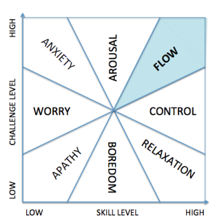
Figure 1. Mental state in terms of challenge and skill levels according to Csikszentmihalyi [11]

are prerequisites of flow and they are referred also as antecedents of flow. Flow conditions include challenge-skill balance, clear goals, and unambiguous or immediate feedback dimensions. A perceived skill and challenge levels can be identified as the central precondition of flow experience [10] (figure 1). Flow characteristics describe the feelings of an individual when experiencing flow. Flow characteristics include sense of control, action awareness merging, loss of self-consciousness, concentration, time distortion and autotelic experience dimensions. On the other hand, it has been argued that the combination of the first eight dimensions of flow leads to flow that is characterised as an autotelic experience (9th dimension). Autotelic experience refers to enjoyable and intrinsically rewarding experiences. The literature shows that flow researches have not achieved a definitional agreement about the deviation of the dimensions into conditions and characteristics. In spite of that Csikszentmihalyi [8] has argued that whenever people reflect on their flow experiences, they mention some, and often all the nine flow dimensions.