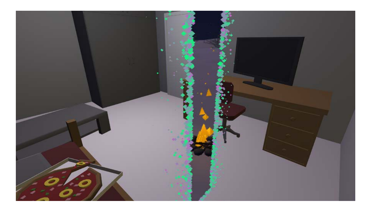
Figure 4. Lost Memories: The city apartment and the portal.