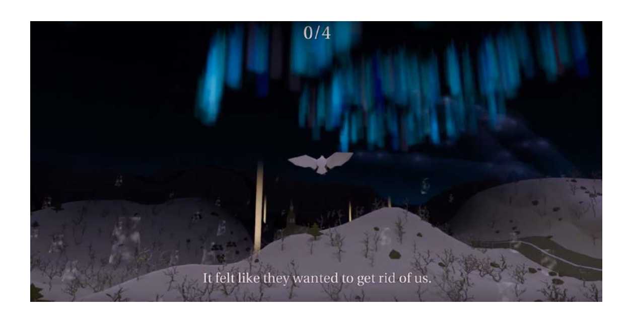
Figure 2. Rievssat flying through eight seasons.