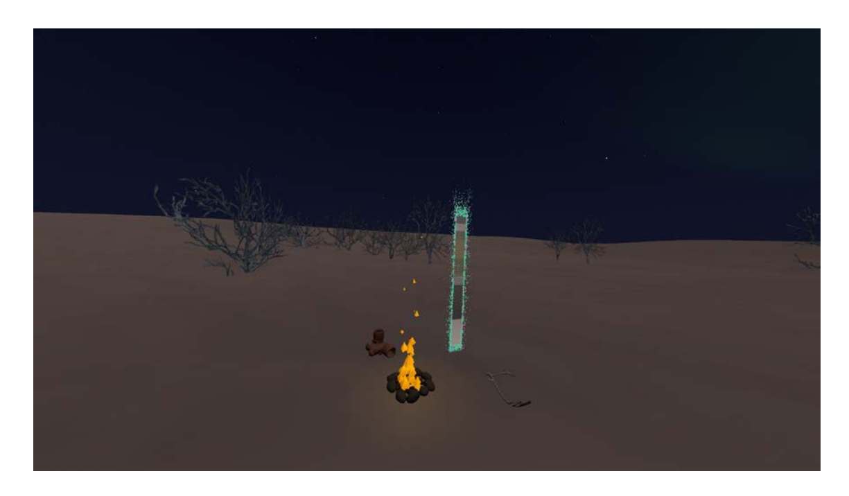
Figure 3. Lost Memories: The Sámiland mountain ambience and the portal