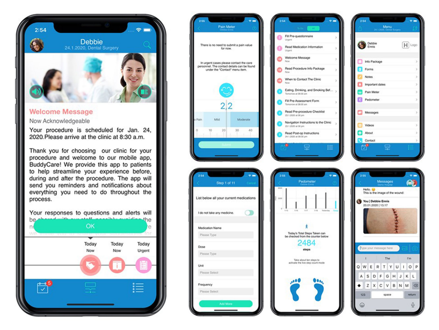
FIGURE 2 The digital patient journey solution can be used during the whole care path [Colour figure can be viewed at wileyonlinelibrary. com]

The DPJ solution has three views: checklist, timeline, and menu views and the user can navigate between these views using the blue navigation panel at the bottom of the screen (Figure 2). The timeline is a visual timeline representation of the care pathway (the path) and is the main view. The timeline contains all the important tasks and instructions that are to be conducted before and after the surgery in chronological order. Tasks are marked with different colours based on their urgency using blue, green, orange, and pink colours. Tasks should be conducted if they are orange. Pink stands for urgent tasks, green tasks have been successfully conducted, and blue ones are upcoming. There is also a search functionality that can be used to search for any information along the timeline. The checklist contains the same information as the timeline, but the tasks are presented in a list format. It is also possible to navigate to a certain part of the timeline by selecting a task in the checklist. The menu contains all the information presented in the timeline, the forms presented in the timeline, a reporting tool for pain, a step-monitoring functionality, a messaging functionality, videos, information about the hospital, the contact information of the hospital, and user settings containing information disclosure.