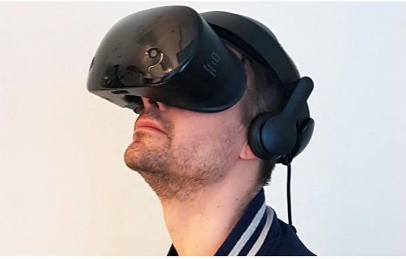
Figure 1. HMD device with an integrated headset.

User Interface and Interaction. In CityCompass VR, the users can freely explore the ODV content by turning their head to the desired direction. The screen is divided into two viewports, thus creating the illusion of a stereoscopy and a sense of depth to the user. Both users have their own HMD (Figure 1) devices and have their own individual views of the application (see Figure 2).