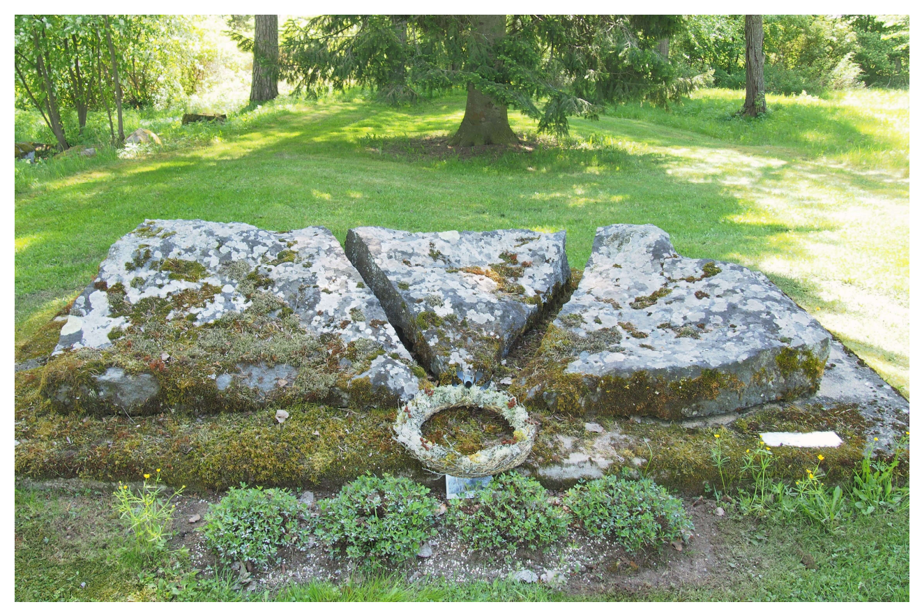
Picture 4. Moss covers black granite of the famine memorial in Jämsä that symbolises the broken life cycle. The memorial wreath was laid at the memorial on 21 May 2018.

apparent consequences of the "death years" that were summarised in Pitkänen's (1993, 116) research results: "During the famine years of 1866–68, short-term population losses (including the deficit in births) reduced the pre-famine population of 1.8 million individuals by about nine per cent." National population loss illustrates the proportions of the tragedy, but death rate calculations also contribute to how famine history is perceived, both nationally and locally. The number of dead on memorials can appear as statistical observations that serve to compare the "local number" of casualties with the "total number" of mortality. While this information is by all means relevant, it can follow from the dichotomy between the full sum and its parts that each of the local hunger histories appear as a numeric "single case" or as a "local example", a perspective that can blur the vision from seeing the inexhaustible sum of crises experienced on the local or, indeed, on a smaller (e.g. communal, familial, individual) scale.