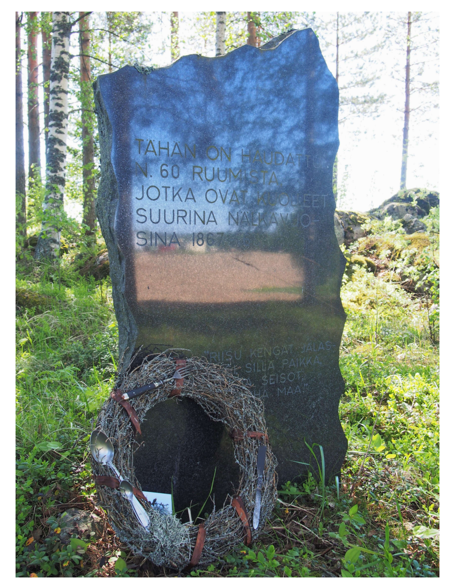
Picture 3. Koiraharju cemetery, Korpijärvi village, Varpaisjärvi, was only meant to serve as a temporary burial area, but the bodies were never removed. The area holds two granite memorials that replaced the original wooden crosses and grave planks. The Biblical reference on both memorials is to Exodus 3:5: "Take off your sandals, for the place where you are standing is holy ground." The memorial wreath was laid at Koiraharju on 22 May 2018.

these were replaced in 1951 by a small, engraved stone, marking the eventually permanent burial of approximately 60 people. In 1981, the local Lions Club arranged for this to be augmented by a gravestone ( Matti ja Liisa 2015). Most recently, in 2012, this stone was itself supplemented (not replaced) by a new, larger memorial, with a slightly extended text.