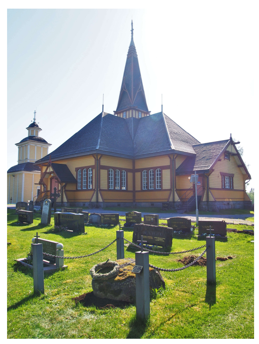
Picture 1. In commemoration of the death and burial of famine victims in Perho, it was commented that their "resting place on the Jängänharju cemeterv has not ever been marked even by a humble wooden cross". Nevertheless, the memorial stone at Perho churchyard (Jängänharju) seems to be a contemporary one from the 1860s with a cross symbol and "1869" engraved on it. The small plaque at the site reads: "Memorial stone for those who died in 1860s hunger years." The memorial wreath was laid at the stone on 21 May 2018.