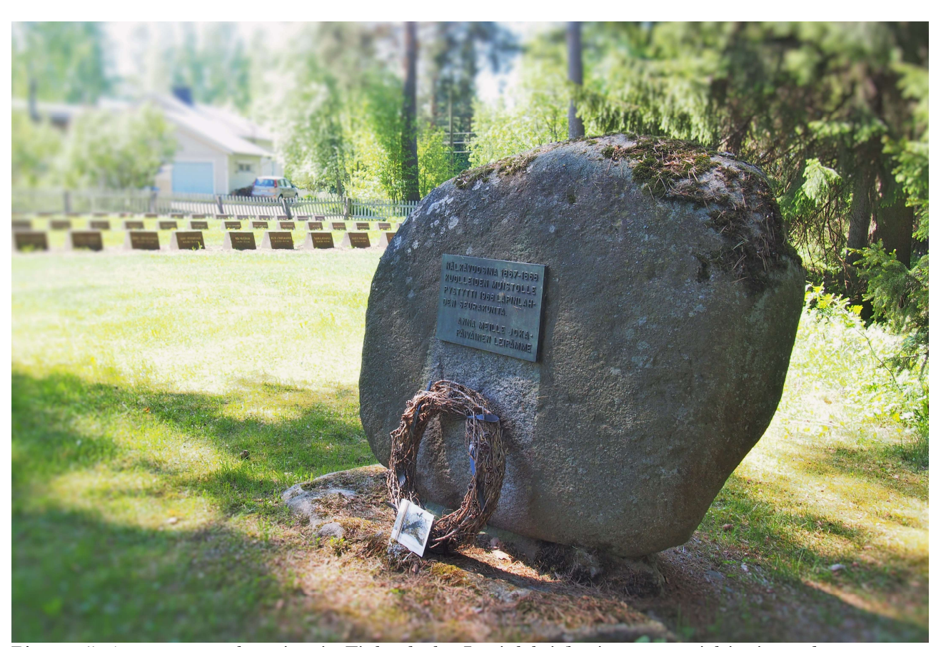
Picture 5. As at many other sites in Finland, the Lapinlahti famine memorial is situated next to war graves. The memorial wreath visit took place on 22 May 2018. Photo: Eliza Kraatari, 2018.