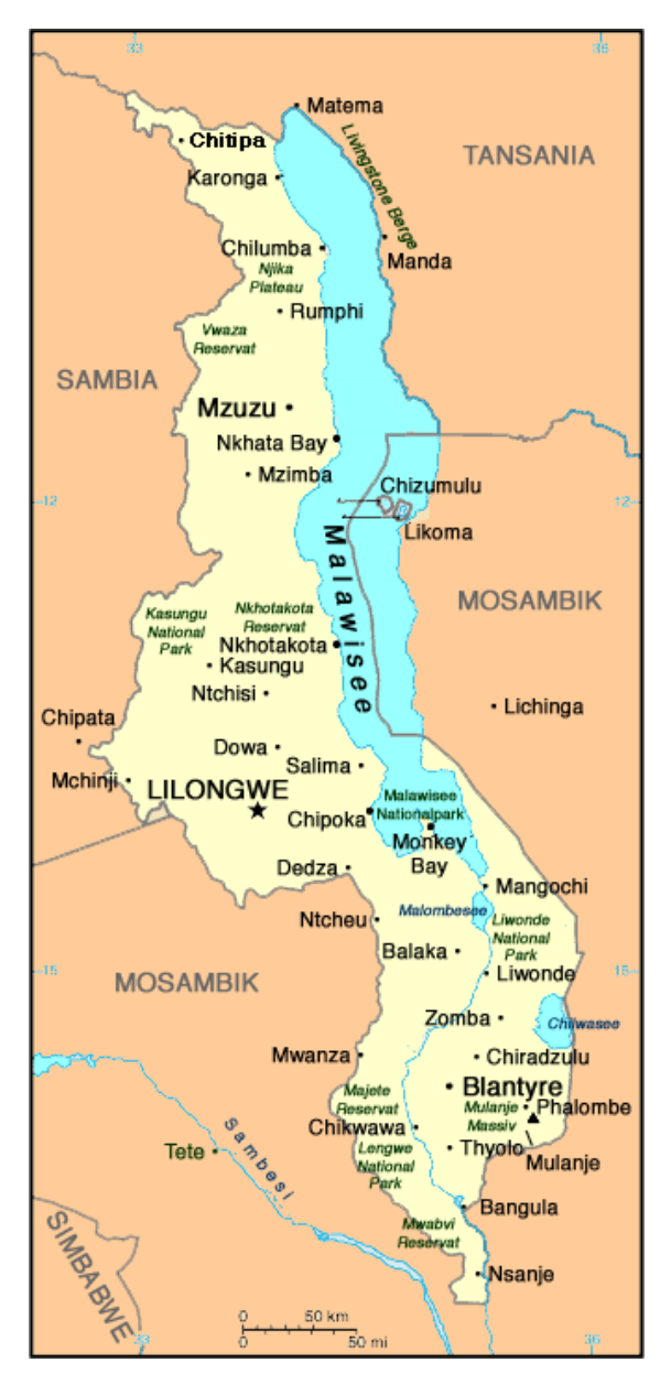
Figure 1. Map of study site