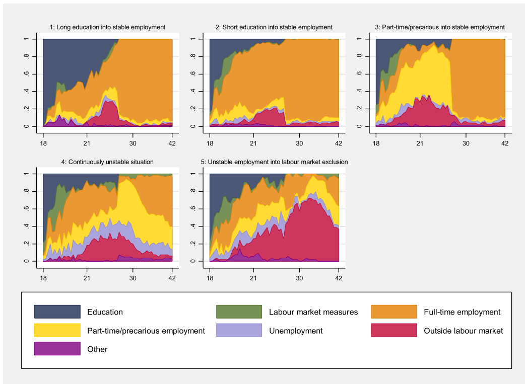
Fig. 2 (See legend on next page.)