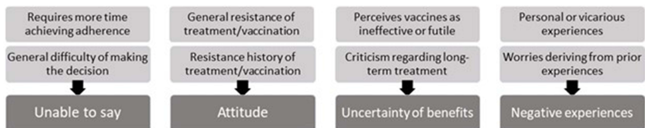
Figure 1 Rationalities of nonadherence: From coding categories to themes.

Among the attitudes toward a healthcare provider, a lack of trust in received information, public sector, or expertise appeared to be in question: “I would go to a private sector provider” or “I would need a specialist”.