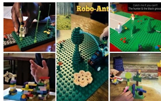
Figure 4: Session 2 games (Top left - Group 3, Bottom left - Group 4, Centre - Group 5, Top right, Group 1, Bottom right - Group 2).

Group five used the Hybridex deck. The game involves playing as a robotic ant that roams the forest collecting data. The video of the game was acted out using Lego to depict the character and the forest. A picture-in-picture mode is used to show what the character sees in the forest using a video of a real forest. Playful music was added to the video for effect along with text displaying the game name.