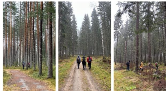
Figure 1: Second field trip.

The second event included a field trip (see Figure 1) that involved a visit to a recreation forest of mixed ownership outside Joensuu in eastern Finland. In this field trip, the participants were forestry researchers (N=20) who were taking part in a networking day that involved following a geocaching trail laid out as part of the UNITE flagship 2 . The geocaches along this trail incorporated surveys with questions relating to human-forest relationships and landscape preferences. Consequently, these topics were prevalent in participants’ discussions during the day.