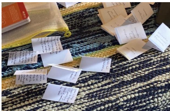
Figure 5: Cards filled by participants.

In session 3, participants were divided into 5 groups, each consisting of 3 to 4 members. The use of card-based methods in this session was not as integral to the process in this session as the previous sessions. Specific decks were not distributed to the groups, and they had the flexibility to use any cards from the three decks offered (VNA, HYBRIDEX, Play potential) and could also use the nature experience cards they were encouraged to create during the outdoors activity (see Figure 5). For creating the videos, the groups once again had access to LEGOs, as well as toys and objects that were found within the workshop location (See Figure 6). Additionally, they incorporated the outdoor elements into their videos.