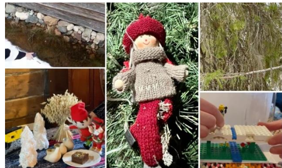
Figure 6: Session 3 games (Top left - Group 1, Bottom left - Group 3, Centre - Group 2, Top right, Group 4, Bottom right - Group 5).

underneath the snow cover. In the final video, a Lego character moves on snow, also made of Lego. It is revealed that there are cavernous structures under the snow and even more things from the previous season hidden beneath the snow.