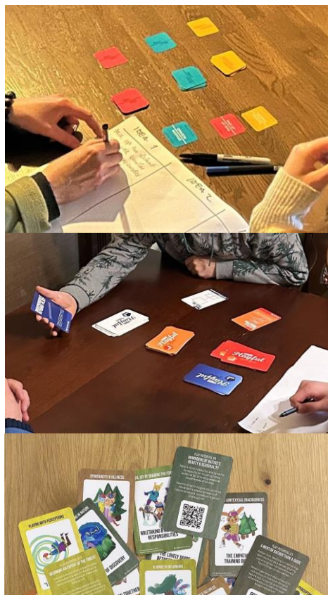
Figure 2: Card-based ideation methods VNA (top), Hybridex Deck (middle) and Play potential cards (bottom).

The second part of each design event centred around a design workshop inspired by game jams [26], a framework in which several organisers and participants had extensive expertise, both practical and academic. The participants were instructed to build on the experiences and recollections of the field trip and use card-based methods to ideate technologically mediated playful interactions with forests. In all workshops, but especially the first two, the Hybridex Deck [27] and the VNA cards [28] were utilised (see Figure 2). Both methods required participants to draw a sequence of cards from a specific deck, whose combination would offer instructions and inspiration on how to develop a design idea.