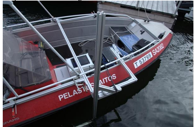
Figure 2. Test equipment installed to a boat

Data gathering was carried out by attaching the sensors to various boats and the sensor data was stored on a laptop computer. The data gathering operation had several different objectives. There was the desire to learn how to calibrate and use sonars and to test sensors and bus software. The test uses ROS nodes and gathered data, as well as gathering data for teaching neural networks and calibrating algorithms. The most significant consideration for neural network-based velocity calculation is that GPS speeds which are not available below the surface of the water can be recorded while driving on the surface. In the data acquisition hardware, the ROS software ran on a laptop to which the devices were connected via USB buses. The devices are installed in the housing of the Fidobox. The sensors were attached to the boat with a bracket made of aluminum profile. Fig. 2. presents a picture of that. The rack proved to be well functional and adaptable. Data was gathered on five different boats.