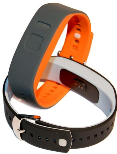
Figure 1. PulseOn optical wrist-worn heart rate monitor used in the study.

30 cardiac surgery patients (9 female, 21 male, 69.3 \pm 6.9 years old) were recruited for the study from Cardiac surgery ward at Tampere University Hospital. The majority of the subjects had undergone either coronary artery bypass or mitral valve replacement surgery. Some had undergone a combination surgery of the two. This group was chosen due to their high risk of post-operative atrial fibrillation [13]. Subjects were monitored for 24 hours with a wrist-worn PPG monitor (PulseOn Oy, Espoo, Finland) shown in Figure 1, leading to roughly 697 hours of data. 5-lead Holter ECG device, eMotion Faros 360 (Bittium Biosignals Oy, Kuopio, Finland) was used as the reference. The monitoring was started on 2 nd to 4 th post-operative day. The subjects were mostly staying in bed during the monitoring. A favorable statement was obtained for the study from the local ethical committee of Tampere University Hospital (R17038). All subjects gave their informed consents in writing.